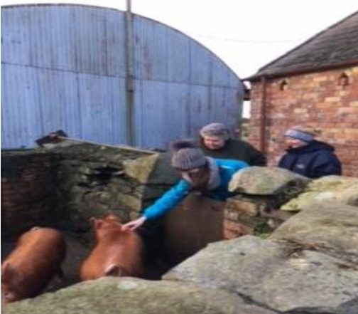
Students visiting Wingrove Farm, Saintfield

As part of the Rural Health module offered to students studying Medicine in Queen's University Belfast two students visited a farm delivering a Social Farming service.