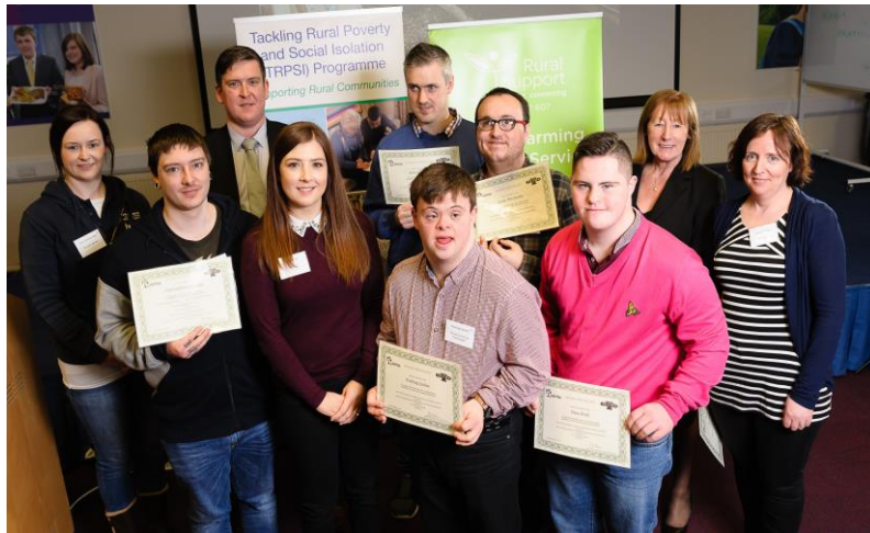
SoFarm participants receiving their achievement certificates