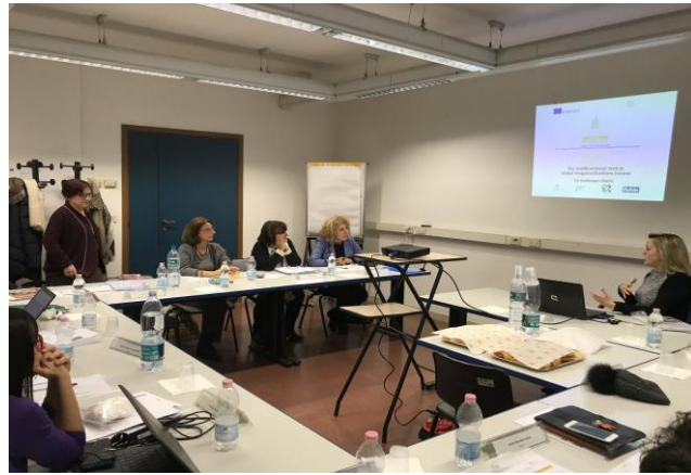
SFSS Coordinator presenting to CRANE partners

In mid-December a meeting of the CRANE project was held in Bologna, Italy. CRANE is an Erasmus+ funded project focused on multifunctional agriculture to develop training for farmers interested in developing the services they provide. The SFSS Coordinator attended the project meeting to outline the Northern Ireland experience of Social Farming and multifunctionality in general. As part of the project seminar, there was an opportunity to visit an educational farm and a Social farm – these visits reflected the Northern Ireland experience of Social Farming whereby the focus is on the participants. The training under development for farmers will be further progressed in 2018 and should offer a valuable service to farmers in Northern Ireland in the future.